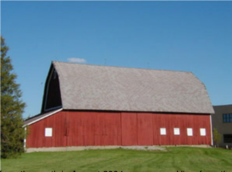
View from the south in August 2004