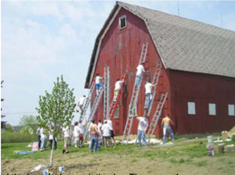
South end of the barn before painting begins. The crew of young men and women progress up the barn.