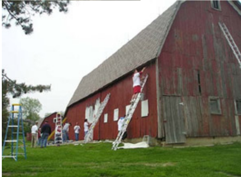
Only a fresh coat of paint to the west side of the barn.