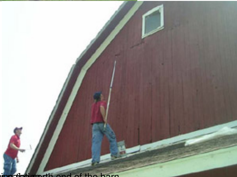
powerwashing to prep the barn siding Priming the north end of the barn